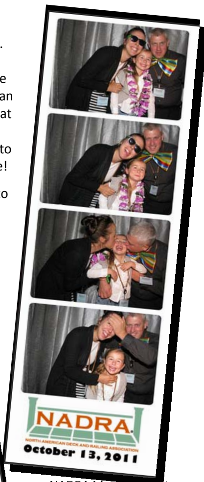
NADRA Members, Autumn Wood Construction Inc. of MI The Wood Family!