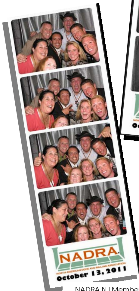
NADRA NJ Members!